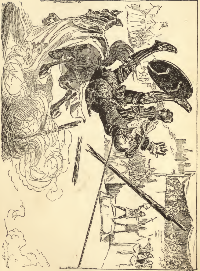
“GREAT SCOTT! BUT THERE WAS A SENSATION”